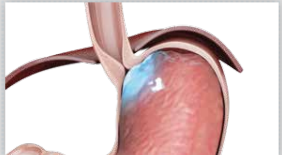
Functional GEV Valve closes to prevent reflux of acid and non-acid stomach fluids

Reflux is caused by changes in the gastroesophageal valve (GEV) that allow acid to flow back from the stomach into the esophagus. The GEV is the body's natural antireflux barrier.