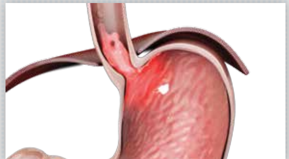
Dysfunctional GEV Valve is unable to close, allowing stomach fluids to reflux into esophagus